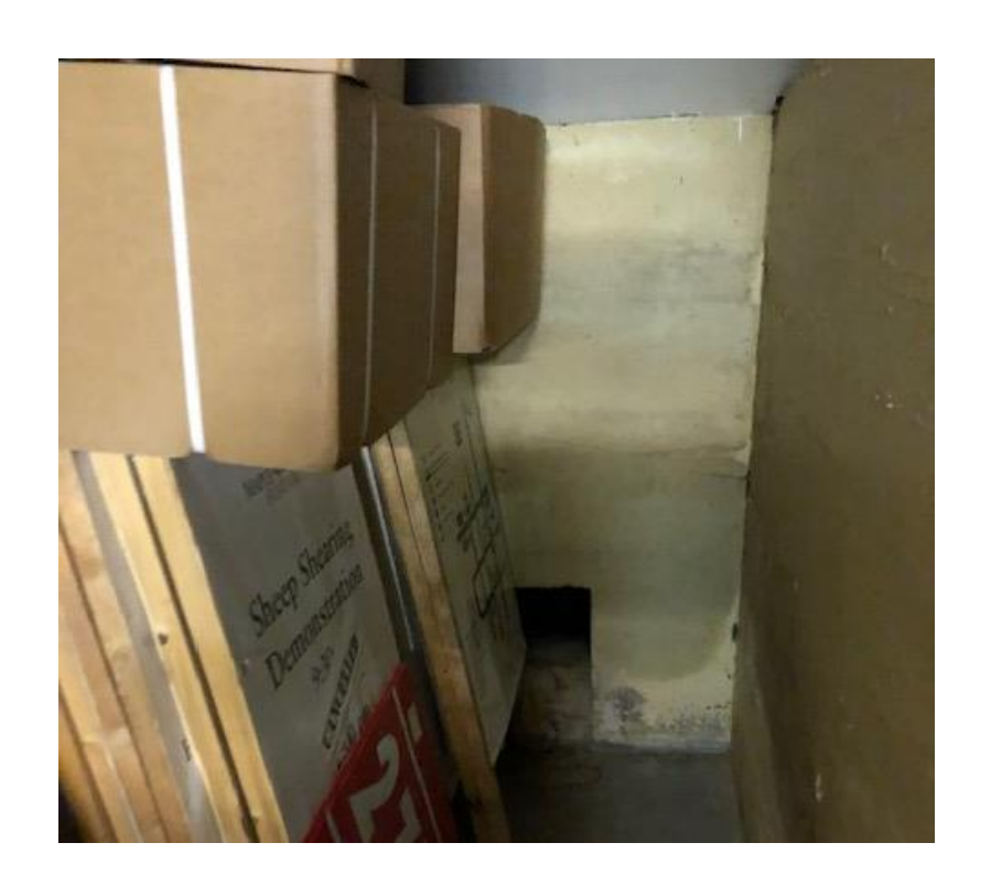
<u>Figure 2:</u> East basement stair well access hole.