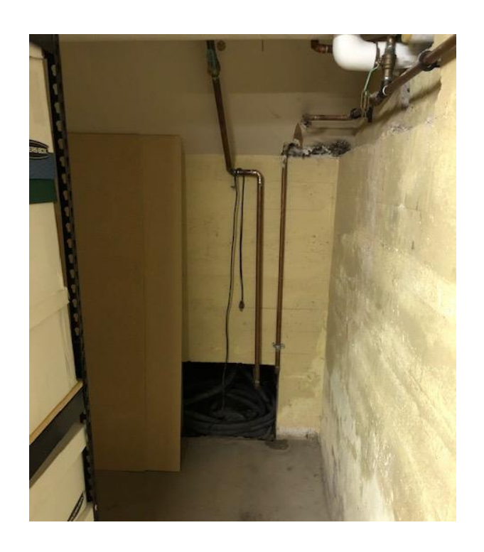
<u>Figure 7:</u> West basement stair well access hole.