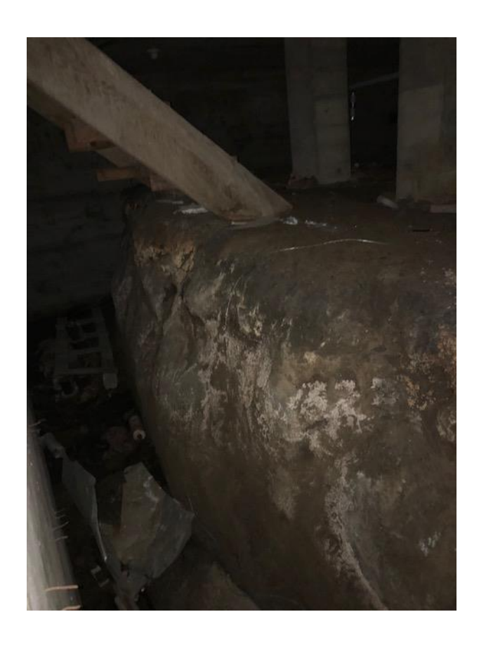
Figure 6: Unfinished crawl space at trench (on west side).