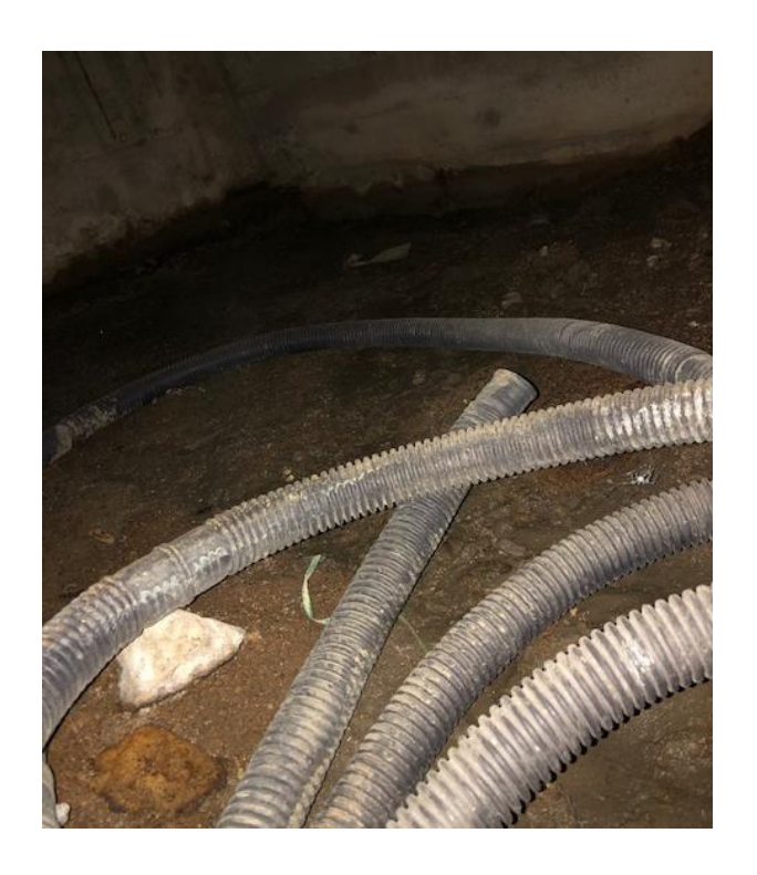
Figure 8: West basement stair well.