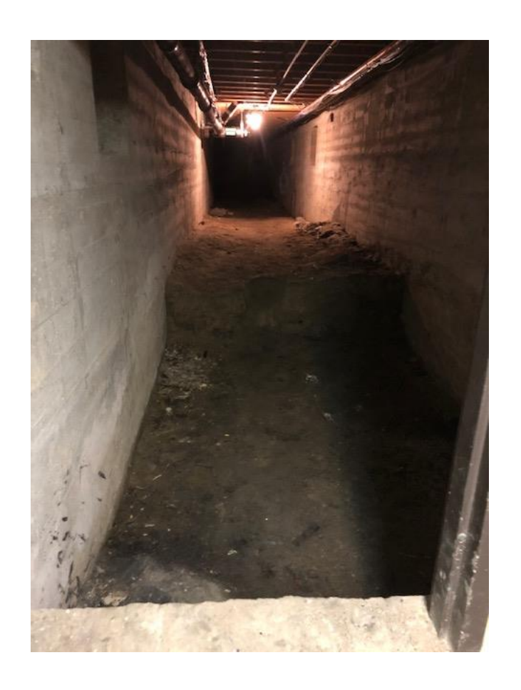
<u>Figure 4:</u> Unfinished basement crawl space.