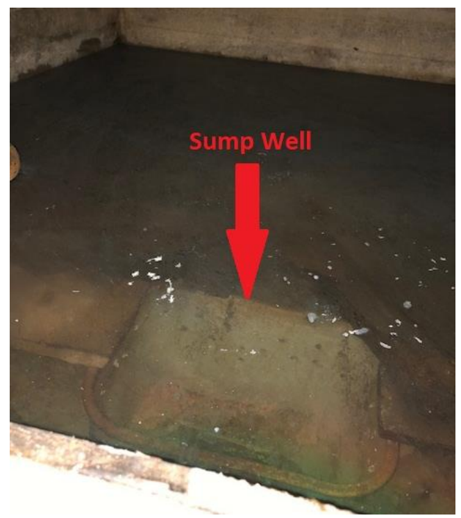
Figure 3: East stair well existing sump well.