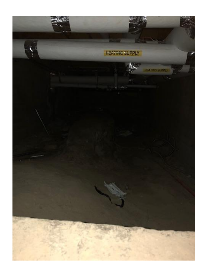
<u>Figure 5:</u> Unfinished crawl space (East Side).